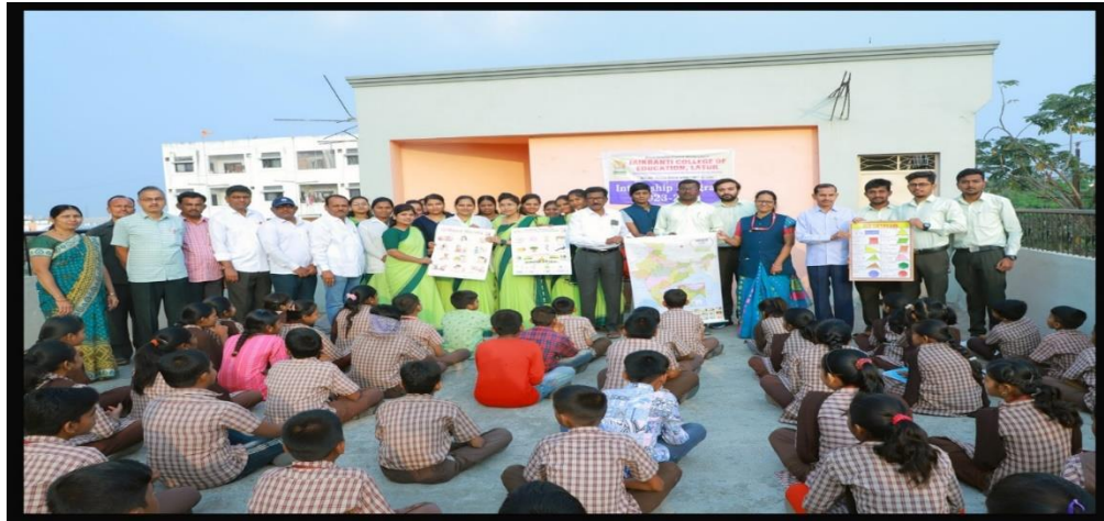
Daily Assembly Activity conducted by B.Ed. students.