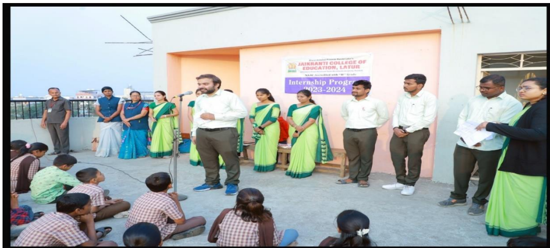
Prize Distribution ceremony.